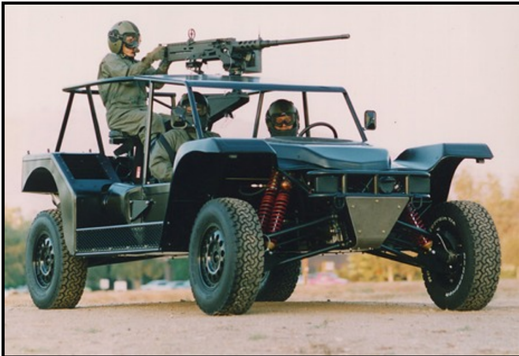
Fast Attack Vehicle.

Very light, very small, very fast, and, if correctly equipped, very lethal. Can carry a host of weaponry including anti-armor. Air transportable by helicopter & fixed wing. Excellent fuel consumption. Inexpensive.