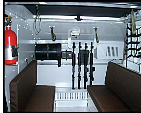
Thunderbolt carries a crew of three – commander, gunner, driver.

The operational significance of this degree of functionality may easily be appreciated.