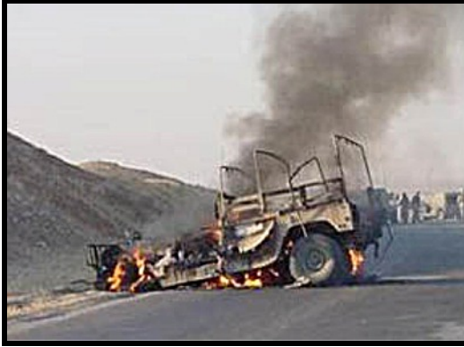
Wheels, even when armored, tend to be less survivable, and largely road bound