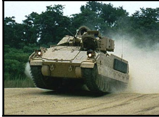
Tracks can carry the weight of arms and armor needed, and don't need roads

“If it has wheels, shoot at it. If it has tracks... you will die”